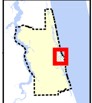
Map Prepared on 5/21/2008