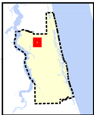
Map Prepared on 5/15/2008